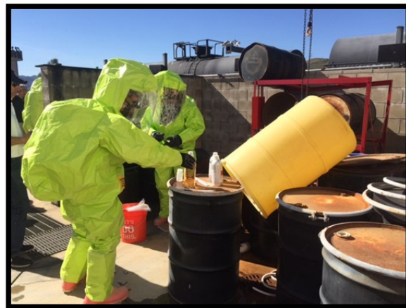
Level “A” Suits