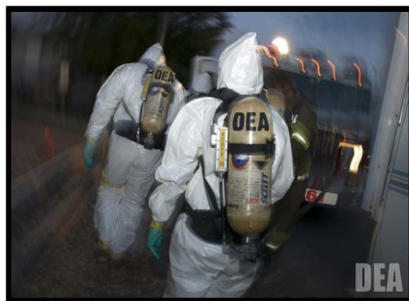
Level “B” Suits