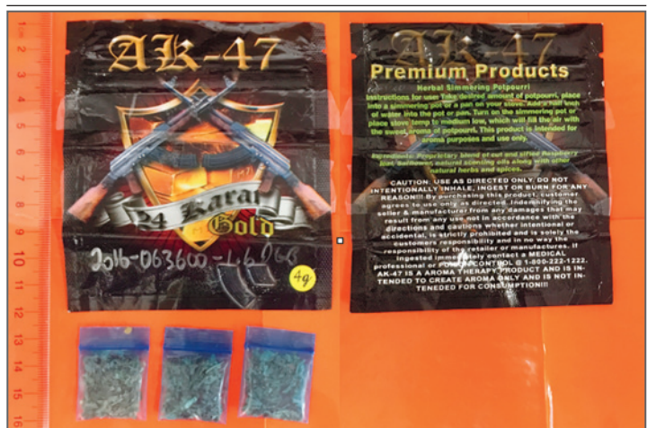
Figure 3. AK-47 24 Karat Gold Foil Wrapper Containing Herbal Products Recovered from a Patient Involved in the Outbreak. Also shown are three of the eight small blue bags containing aliquots of the agglutinated herbal material.

Department of Homeland Security became aware of this outbreak because of its scale and rapid evolution and because of the media coverage. On the basis of the fact that this was a large local outbreak and that the mode of drug exposure was smoking, it seemed possible that a potent synthetic cannabinoid agonist was involved, but patient interviews provided no indication of the identity of the compound. The DEA subsequently obtained biologic samples from 8 of the 18 patients in the outbreak who were transported for medical care, including the patient described above, and sent the samples to their collaborators for comprehensive drug analysis with the use of high-resolution mass spectrometry. In addition, a sample of the product that had been smoked by another patient who was brought to the emergency department and that had been turned over to the New York City Department of Health and Mental Hygiene and given to the New York Police Department Crime Laboratory was also analyzed. The implicated product — “AK-47 24 Karat Gold,” shown in Figure 3 — consisted of agglutinated herbal material that had been divided into aliquots in eight small blue bags.